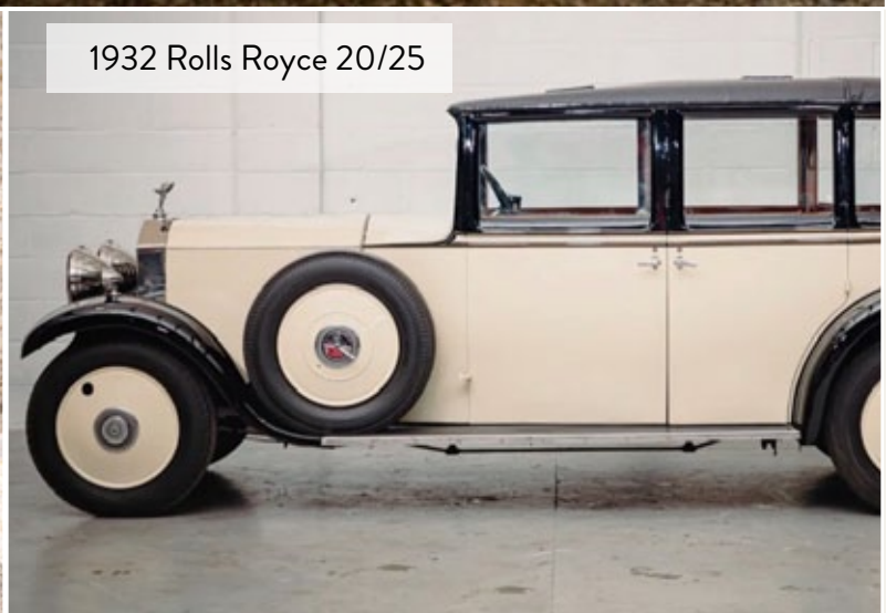
1932 Rolls Royce 20/25