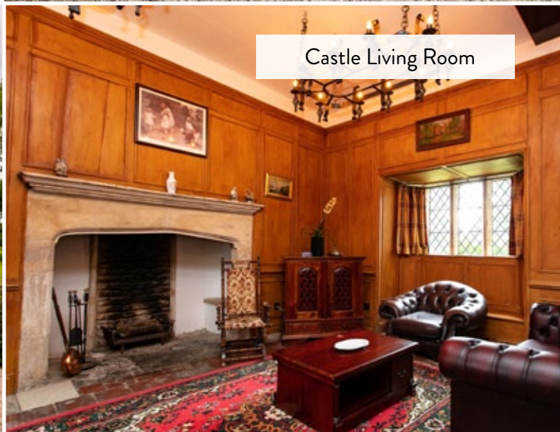
Castle Living Room