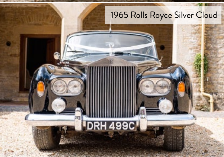
1965 Rolls Royce Silver Cloud