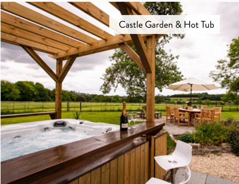
Castle Garden & Hot Tub